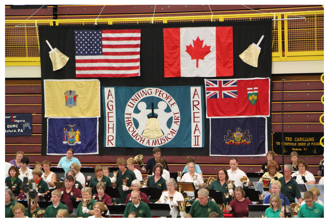
Our Area 2 Banner—always a great sight!